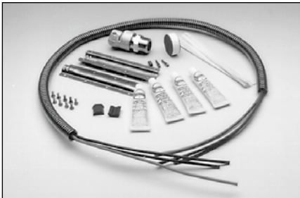
CET: Factory fabricated cold-end termination. CETK: Field fabricated cold-end termination kit.

In-Line Splices: When the circuit length exceeds the practical length of a cable reel or to facilitate the installation of the cable, an under insulation splice may be required. The splice utilizes a stainless steel housing (sized for the conductor type and number), butt lug splices, grounding lugs, insulating tape and sealant.