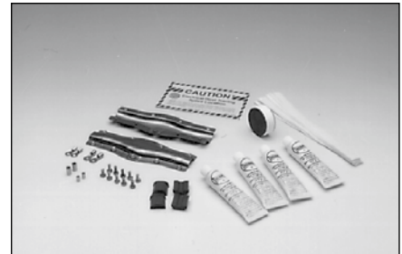
HST: Factory fabricated splice termination. HSTK: Field fabricated splice termination kit.